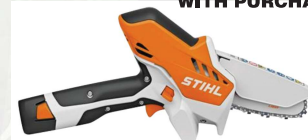
GTA26 Cordless P (GA01-011-6911) (886)