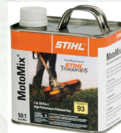
64-Oz. Motomix® GALLON (70108710248)