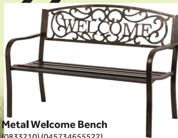
Metal Welcome Bench (0833210) (04573465522)